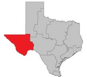
Trans Pecos (TX) percent area in U.S. Drought Monitor categories

West Texas is the epicenter of drought in our state. Drought has been present in at least one of the 14 counties of the Trans Pecos Climate Division since April 2020. Almost half the division is currently experiencing exceptional drought conditions. Only 2 percent is drought free.